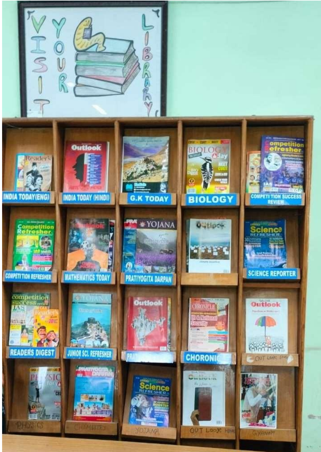
Magazines subscribed in the college library