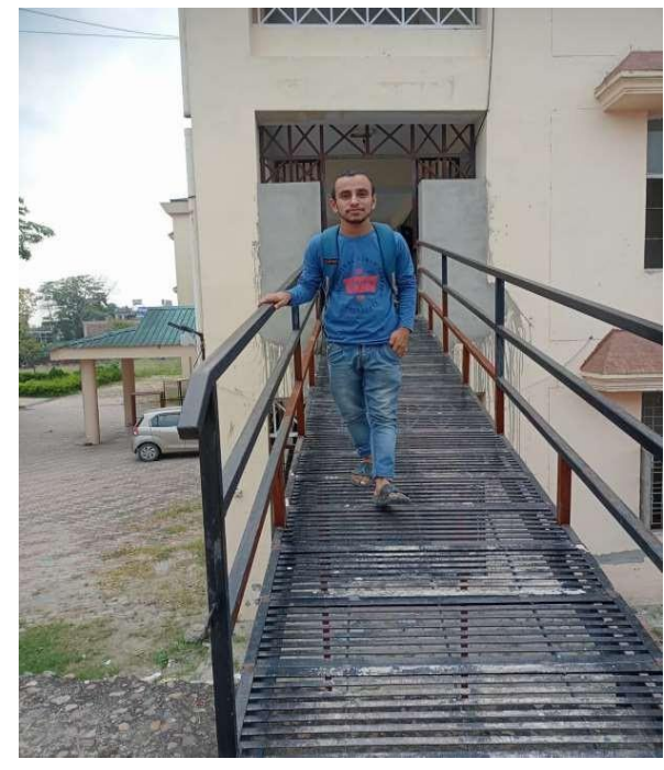
Ramps in the Science Block Building and College Canteen