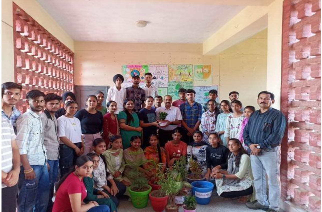
Plantation Drive organized by Commerce Department on 29.08.2023