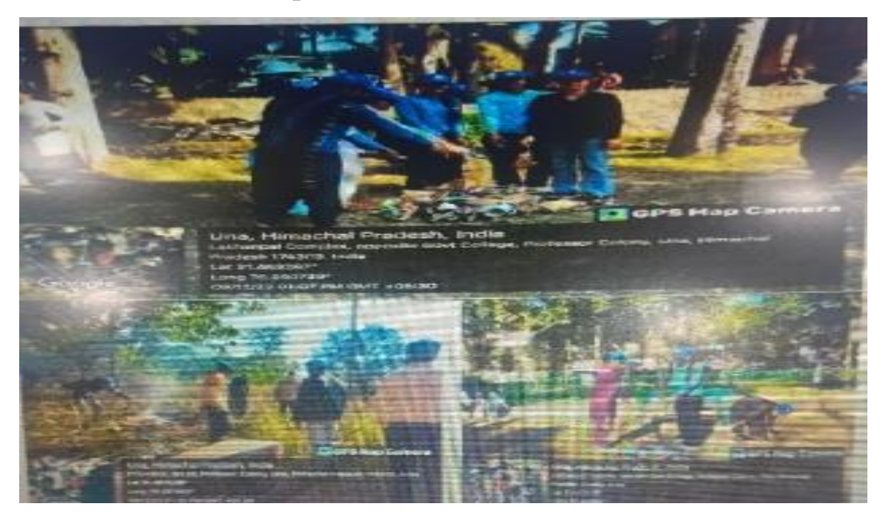
Swachhata hi Seva Campaign