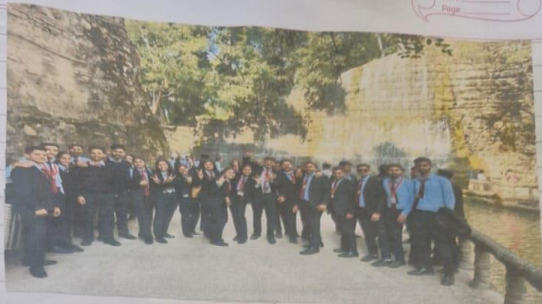
Roke Garden, Chandigarh

Day 2:- On 18 th November, 2023, the students were taken for visit to FRI (Forest Research Institute) and India Glycols Limited, Dehradun after which students were destined to Haridwar, Uttarakhand.