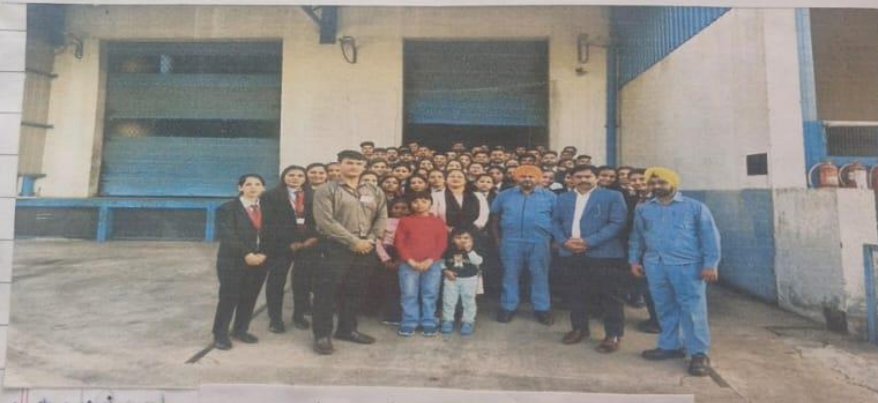
Times of India, Panchkula