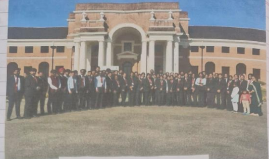
Forest Research Institute, Dehradun